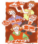
Family Night Supper