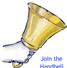
Join the Handbell Ringers

today! Watch for the "ringing" time for this group to practice.